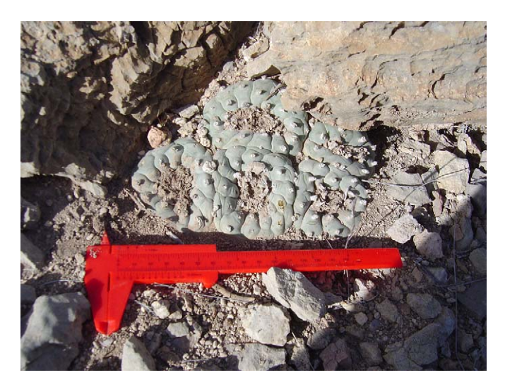
Fig. 1. Peyote ( Lophophora williamsii ) in its natural habitat in the Chihuahuan Desert. This cluster of five mature adults is about 150 mm long.

M. Terry et al. / Journal of Archaeological Science xx (2005) 1-5