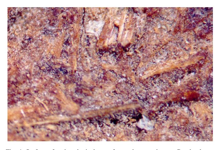
Fig. 4. Surface of archaeological manufactured peyote button. Randomly arranged pieces of fibrous tissue from plants other than peyote were incorporated into the specimen matrix.

The peyote material from the Lower Pecos was recovered from Shumla Caves, a series of nine caves located on the Rio Grande in Val Verde County, Texas. Cave No. 5 (41VV113) was excavated in 1933 by the G.C. Martin expedition [13], but the provenience for the archaeological assemblage removed from the cave was not recorded during the fieldwork. The published report of the Martin expedition, however, notes 'a single mummified example (of peyote) from Cave No. 5' [13]. Schuetz noted the presence of peyote in the Martin expedition materials in her cataloguing efforts at the Witte Museum a quarter of a century after the Martin