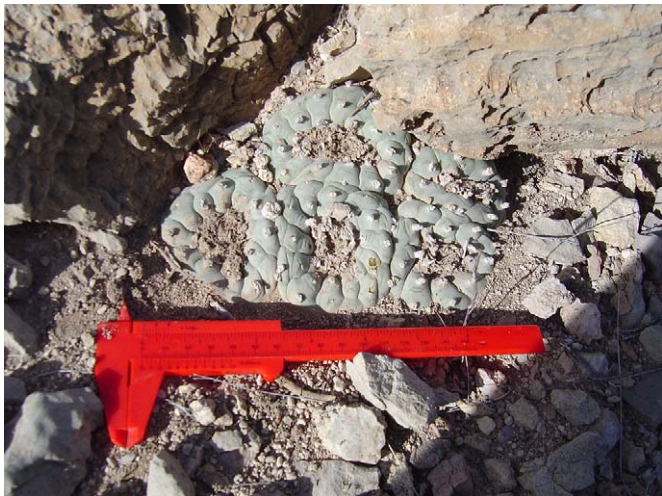
Fig. 1. Peyote ( Lophophora williamsii ) in its natural habitat in the Chihuahuan Desert. This cluster of five mature adults is about 150 mm long.

plant materials to form flattened hemispheres vaguely resembling peyote buttons (Figs. 3 and 4). Bruhn et al. [6] demonstrated that the Shumla Caves' specimens do contain some peyote tissue, as they have a high (2%) mescaline concentration