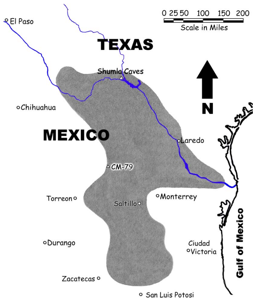
Fig. 2. Map showing approximate locations for Shumla Caves (in Texas, a few meters north of the Rio Grande, near the mouth of the Pecos River) and CM-79 (in Coahuila, Mexico). The region where peyote grows naturally is indicated by the shaded area.

The two sites featured in the current study are sheltered sites containing an abundance of perishable remains; beyond that fact, there are similarities and differences worth noting. The archaeological peyote finds discussed in this paper come from the Lower Pecos River region of southwestern Texas and the Cuatro Ciénegas region of Coahuila, Mexico – both of which lie within the natural geographic distribution of the cactus (Fig. 2). While both these sites are considered to be within the Chihuahuan Desert [8], Cuatro Ciénegas lies about 350 km south-southwest of the Lower Pecos, in the Coahuiltecan subprovince of the Chihuahuan-Coahuiltecan Plateau and Ranges [9], while the Lower Pecos is near the northeastern edge of the Chihuahuan Desert, at the western edge of the Edwards Plateau. This geographic difference is reflected in differences in physiography, but calcareous soils