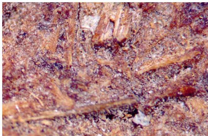
Fig. 4. Surface of archaeological manufactured peyote button. Randomly arranged pieces of fibrous tissue from plants other than peyote were incorporated into the specimen matrix.

We removed approximately 10 mg of material from the interior of each specimen. An acid–base–acid pretreatment was performed on plant material: two soaks in hot (90 °C) 1 M HCl; followed by two soaks in hot 1 M NaOH; and then two additional hot soaks in 1 M HCl. Afterward, samples were repeatedly rinsed with ultrapure distilled, de-ionized water. Remaining plant material was combusted to CO 2 and converted to graphite for an accelerator mass spectrometer target. A split of the CO 2 was taken for stable isotope analysis ( \delta^{13}\text{C} ). Radiocarbon measurements were conducted at Lawrence Livermore